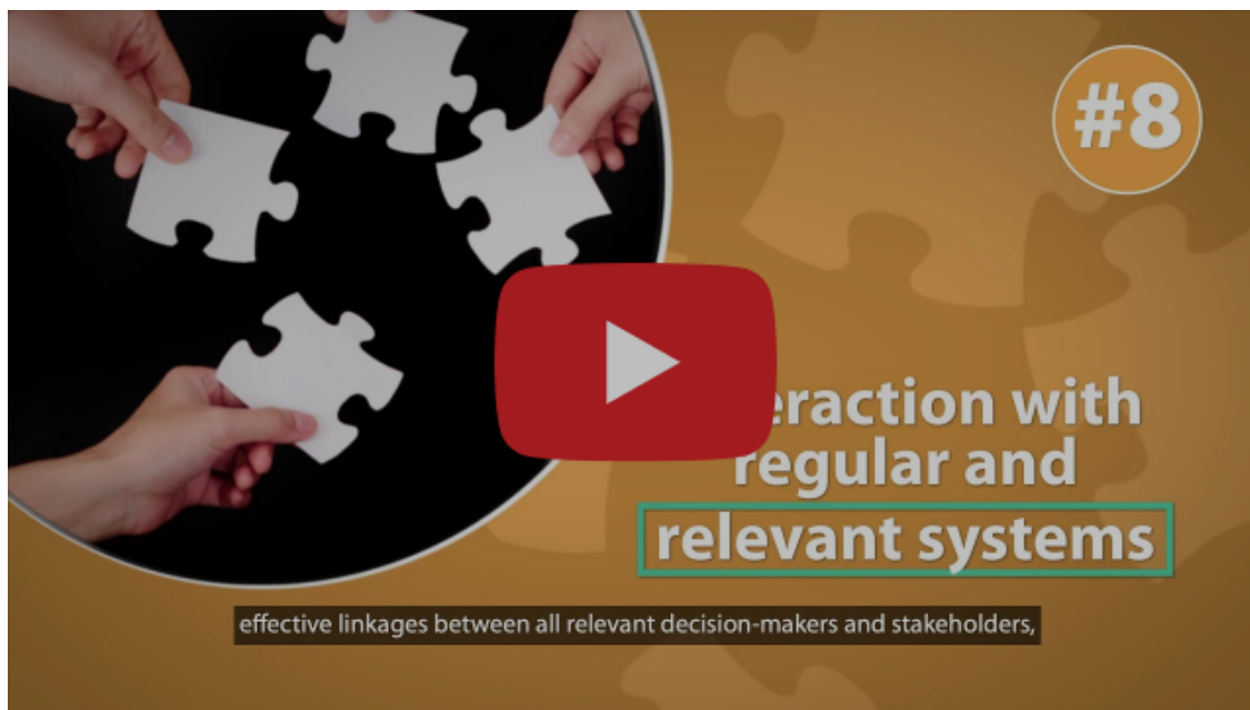
CHRODIS+ Recommendations and Criteria (QCR Tool)

You can view the instructional video below or the trifold brochure here .