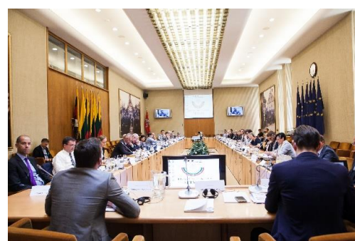
Country stakeholder meetings in Romania (top), Lithuania (middle) and "State of the EU" event at the European Parliament (bottom).