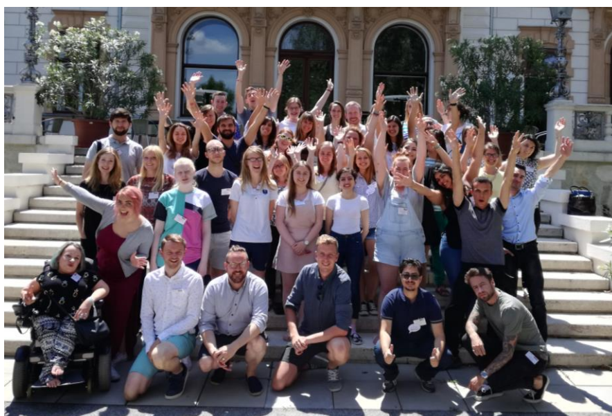
The participants to the Summer Training Course for Young Patient Advocates in Vienna.

The first edition of this newly branded EPF programme was a success and helped to strengthen the bonds within this very unique, motivated, and inspiring community of young patient advocates.