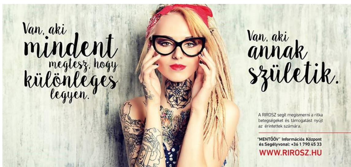
The communications campaign on rare diseases by HUFERDIS, the Hungarian Federation of Rare and Congenital Diseases.

The module proved to be highly useful for all the participating organisations, who highlighted the importance and value of being able to share experiences with fellow patient organisations.