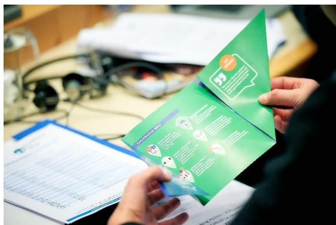
EPF in a nutshell. AGM delegate reviewing our new brochure

With this vision in mind, EPF strives to eliminate disparities and barriers related to access and address standards of care and health inequalities within the EU.