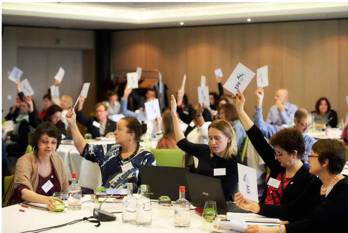
Members voting at EPF AGM 2017

In 2017, the EPF family was delighted to welcome seven new members :