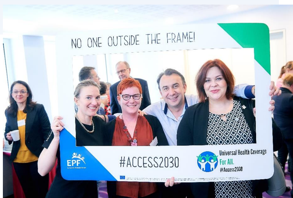
Supporters of our campaign at the AGM

Advocating for health in all policies: developed a Statement on the 2017 country specific recommendations on health and long-term care and the European Semester Process.