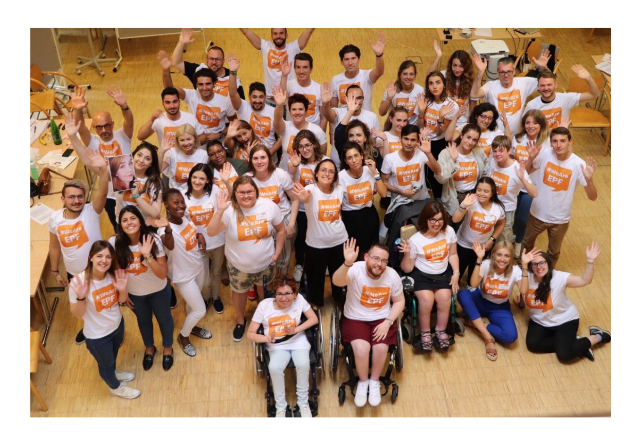
Summer Training Course for Young Patient Advocates (STYPA) 2019: #Advocates4Health

This year's edition of STYPA took place in Vienna, Austria with the theme "Shaping the future of patient advocacy", in July 2019