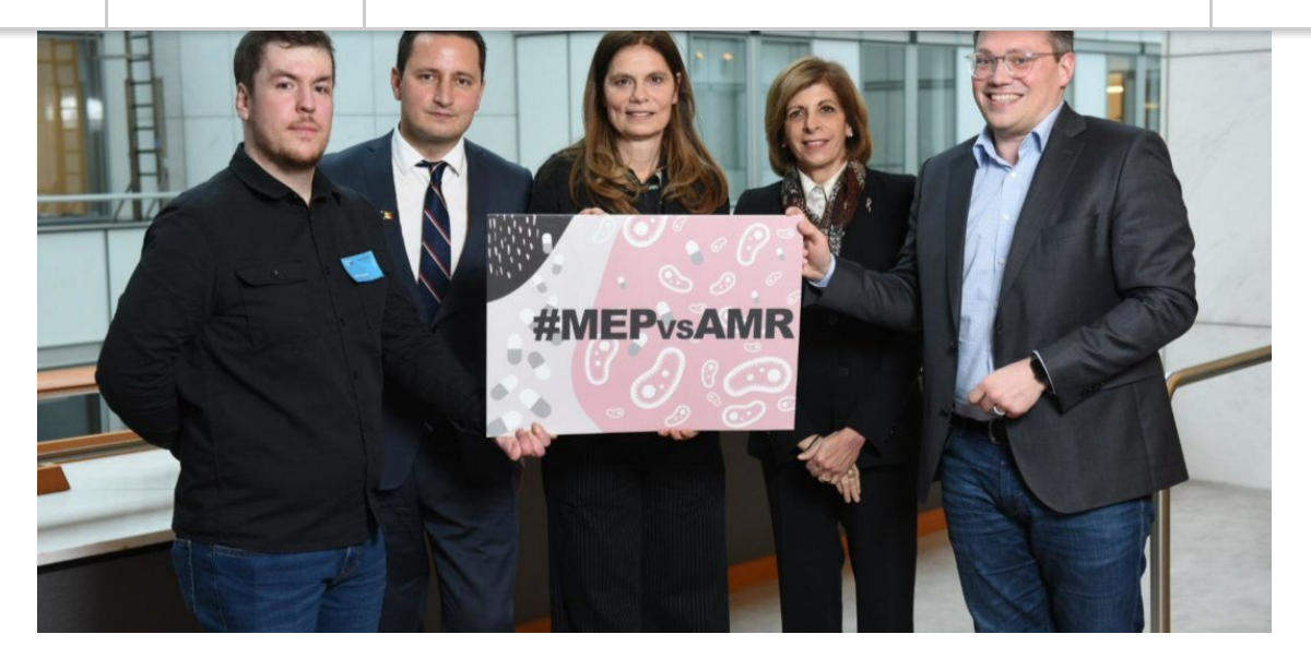
MEP Interest Group on Antimicrobial Resistance Official Launch

At the high-level launch of the MEP interest group on AMR which took place on 19 February 2020 at the European Parliament, a packed room of key actors committed to tackling Antimicrobial Resistance (AMR) from a One Health approach, agreed that everyone must do their part in fighting AMR. The new MEP Interest Group, composed of fifteen MEPs from across the political spectrum, is the only AMR-dedicated group in the European Parliament. Driven by a comprehensive strategic work programme guiding its activities for the parliamentary term 2019-2024, the MEPs fight AMR Group will use its leverage to ensure that AMR stays high on the European policy and political agenda and effective actions are taken at European, national and local level to combat this global health threat.