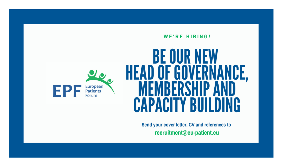
We are hiring a new Head of Governance, Membership and Capacity Building!

Before joining EPF, Flavia handled communication & PR activities for both public and private hospitals in Romania, and also worked together with national patients' associations on various communication and patient education projects.