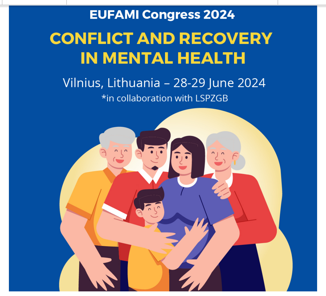
SAVE THE DATE! EUFAMI will be holding a Congress centred around Conflict and Recovery in Mental Health on 28-29 June 2024 in Vilnius, Lithuania

"The Congress will be carried out in collaboration with our Lithuanian member-organisation LSPŽGB.