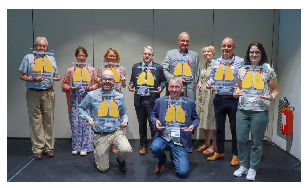
European Lung Health Group launches #KeepBreathing campaign for better lung policy in Europe

To mark the day, EFA has also released new video series as part of their Atopical Lives project, showcasing the reality of patients living with atopic eczema. The new series consists of two episodes, "Under the skin you see" featuring adult patients and their families, and "Skin in the game" , which tells the story of two young girls and their loved ones supporting their continuous search for wellbeing. The video series is available on EFA's website and on YouTube .