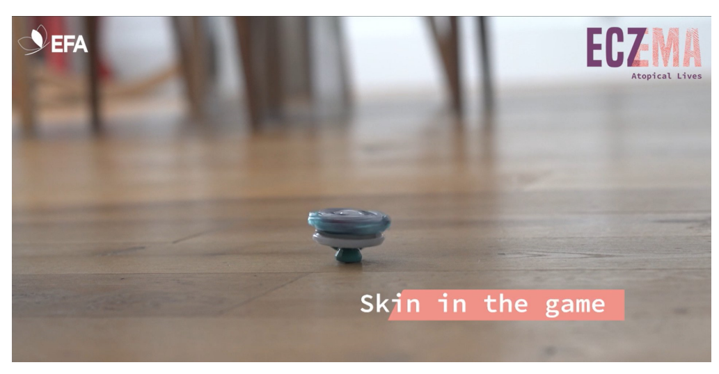
EFA launches new video series featuring patients on their daily journey with atopic dermatitis

On 14 September, World Atopic Eczema Day , the European Federation of Allergies and Airways Disease Patients' Associations (EFA), in collaboration with GlobalSkin, mobilised patient communities across the globe to raise awareness of the psychosocial burden of children and youth living with Atopic Eczema through the #IfYouOnlyKnew campaign.