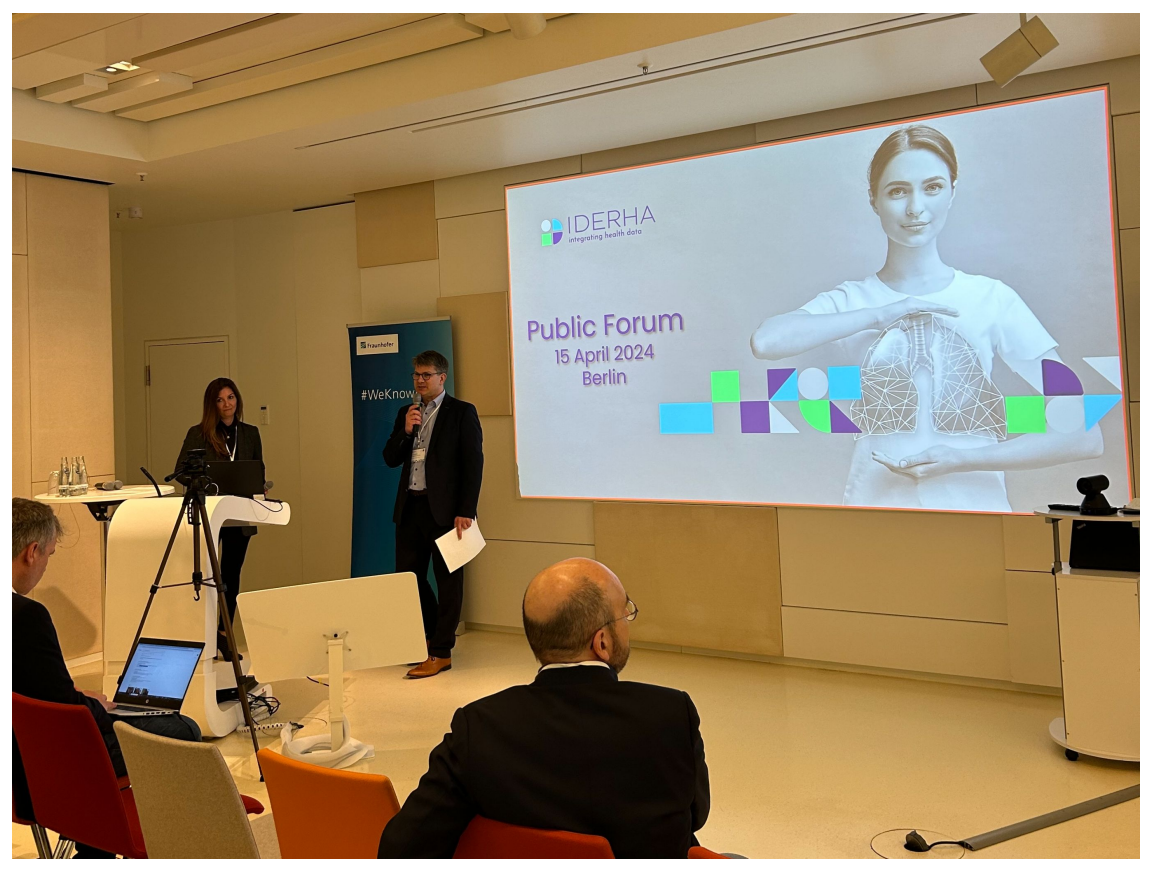
IDERHA hosts their first Annual Public Meeting at the Fraunhofer Forum, in Berlin

On 15 April 2024, IDERHA hosted their first Annual Public Forum at the Fraunhofer Forum, in Berlin .