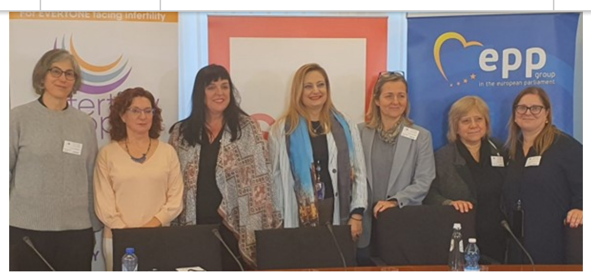
Fertility Europe: Minds Matter. Empowering Infertility Patients with Psychological Support

European Fertility Week 2023 event in the European Parliament, Brussels